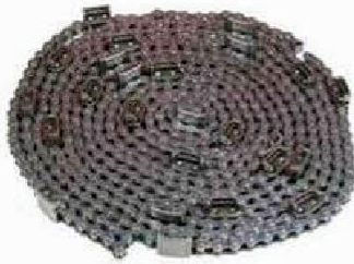
03-63 ▶ 03-77