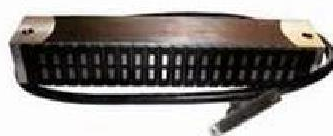
17-32 ▶ 17-35